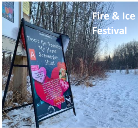
Fire & Ice Festival