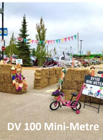
DV 100 Mini-Metre