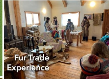
Fur Trade Experience