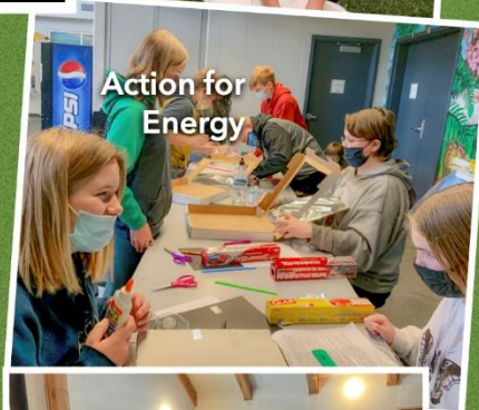
Action for Energy