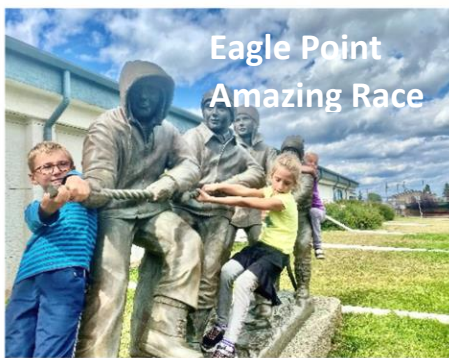
Eagle Point Amazing Race