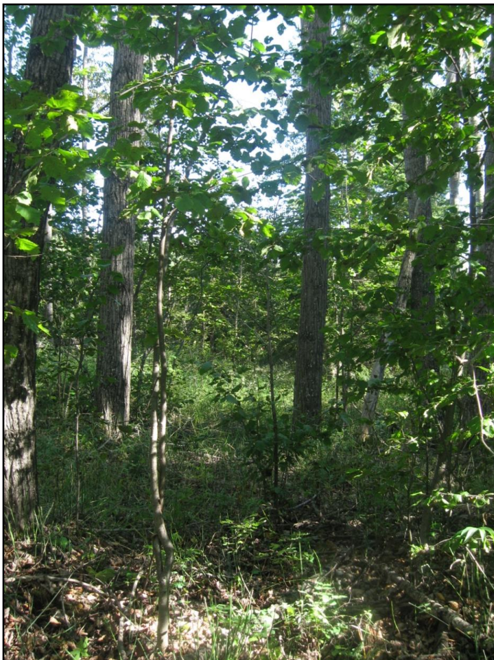
Typical Balsam Forest vegetation.

Field work and subsequent analysis identified six distinct terrestrial vegetation communities amongst the native vegetation of the Park System. This report describes these six natural vegetation communities, including a list of expected species and a map of the spatial distribution of communities across the Park System. The report also gives a general overview of aquatic ecosystems, and provides a guide for identifying the different communities in the field.