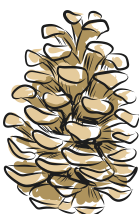
PINE CONE 10 POINTS