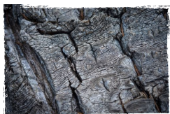
ROUGH BARK 10 POINTS