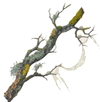
LICHENS 20 POINTS