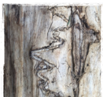
BARK BEETLE TUNNELS 20 POINTS