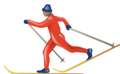
NORDIC SKIER 25 POINTS