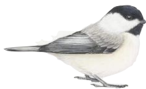
CHICKADEE 30 POINTS