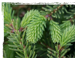
YOUNG SPRUCE TREE 10 POINTS