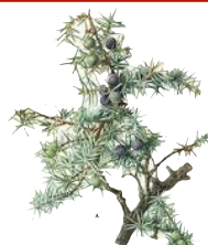
JUNIPER SHRUB 40 POINTS