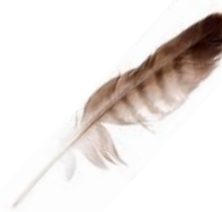
FEATHER 20 POINTS