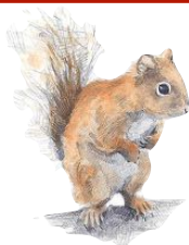
RED SQUIRREL 25 POINTS