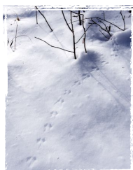
VOLE TRACKS 30 POINTS