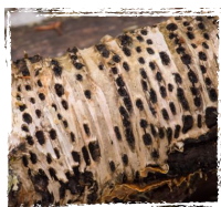
SAPSUCKER HOLES 50 POINTS