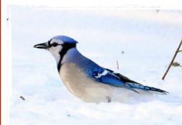
BLUE JAY 30 POINTS