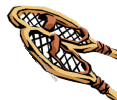
SNOWSHOES 40 POINTS

For more activities, visit our Blog Posts on www.epbrparkscouncil.org