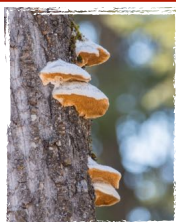
FUNGUS 20 POINTS