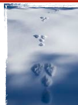
SNOWSHOE HARE TRACKS 50 POINTS