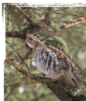
GROUSE 60 POINTS