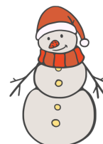
SNOWMAN 10 POINTS