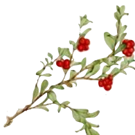
KINNIKINNICK 25 POINTS